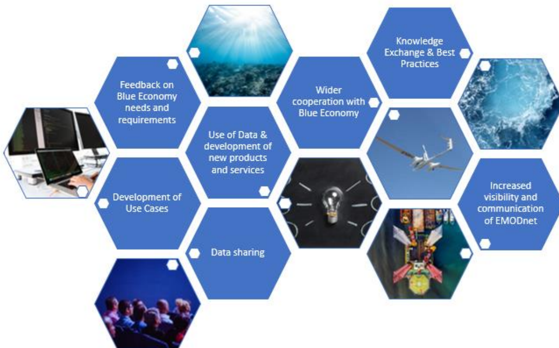
Figure 2. EMODnet Associated Partnership benefits