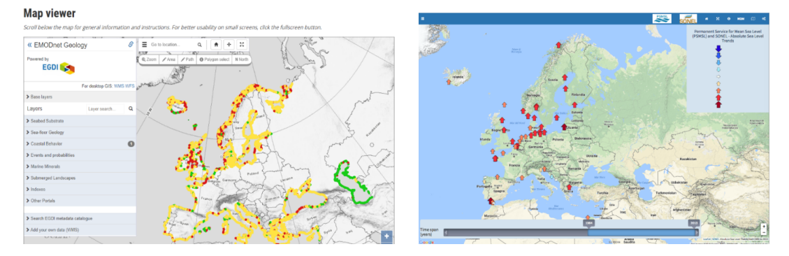
Figures showing examples of key EMODnet data and data products relevant for sea level rise. Links to EMODnet Geology and EMODnet Physics map viewers

Sea-level is one of the most important Essential Climate Variables (ECV), considering that its evolution over the next few decades is predicted to