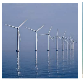
Wind Farm Siting