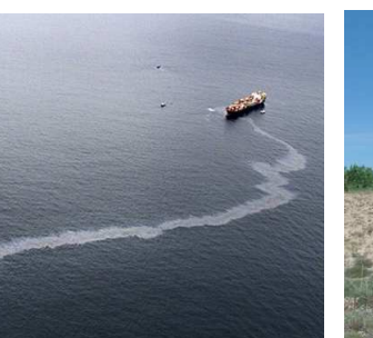
Oil Platform Leaks