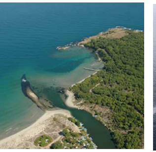
Marine Protected Areas