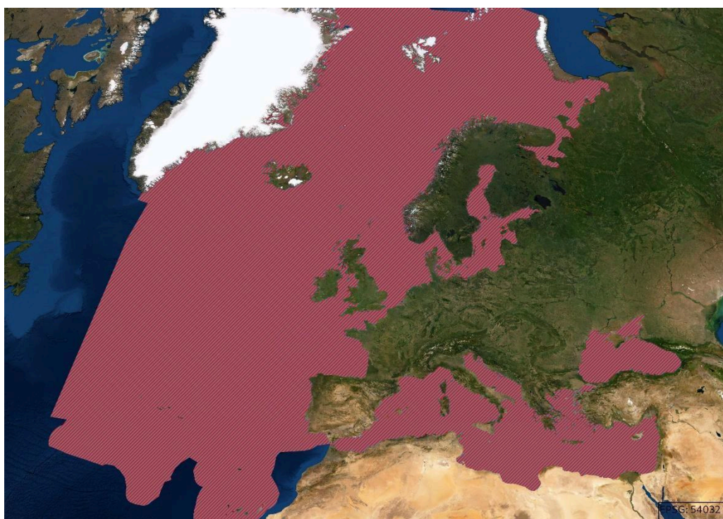
Figure 6. Main coverage area (excluding the Caribbean sea) based on the dataset ‘Europe’s seas’ published by the European Environment Agency (EEA).

The coverage area includes: the Baltic, Barents, Black, Mediterranean and North Seas completely; jurisdictional waters (including the continental shelf and claimed extended continental shelf) of Member States, United Kingdom, and Norway for the Northeast Atlantic (Celtic Seas, Iberian Coast and Bay of Biscay, Macaronesia, Norwegian Sea, and Caribbean Sea).